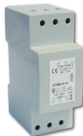
DAT02A 1A Mains Bell Transformer DIN Rail Mounted 4/8/12V AC