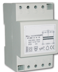
DAT03A 2A Mains Bell Transformer DIN Rail Mounted 4/8/12V AC