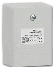
DAT01A 1A Mains Bell Transformer 4/8/12V AC